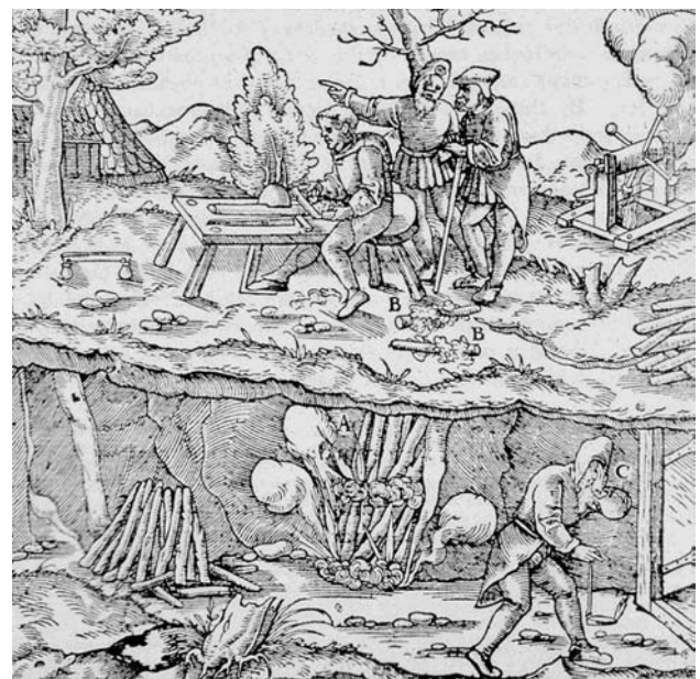
Figure 1 Mining in the Middle Ages, as depicted by Agricola 1556 (Tr1950). Fires were set to shatter rocks and break open veins of metal ore, as this man has done who is obviously on his way out. Agricola wrote, “While the heated veins and rock are giving forth a foetid vapor and the shafts or tunnels are emitting fumes, the miners and other workmen do not go down in the mines lest the stench affect their health or actually kill them.”

In 1950 the USPHS in cooperation with other Federal and State agencies initiated a program to assess hazards