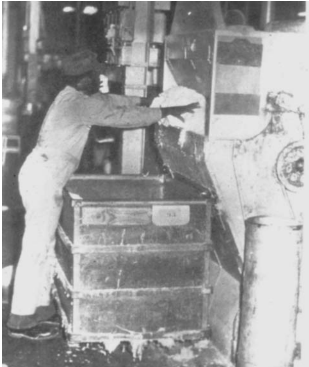
Figure 5 Worker loading chrysotile asbestos fiber by hand and without respiratory protection into the feed hopper of a carding machine at Marshville, NC, textile plant, prior to plant's acquisition and redesign by Raybestos Manhattan in 1969 (Lewinsohn et al. 1979)

smoking into account, and use of “best evidence” of cause of death, in place of unverified death certificate information (Hammond et al. 1979) (Tab. 3). In another ground-breaking study, death rates from two extremely rare cancers, pleural and peritoneal mesothelioma, were tabulated by duration of employment (Tab. 4). The dramatic dose-responses observed greatly reinforced the argument that asbestos insulation work was a severe cancer hazard (Selikoff et al. 1979).