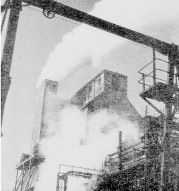
Figure 4 Coke oven plant in which bituminous coal is converted to coke for subsequent use in blast furnaces as an integral part of manufacture of steel. Workers assigned to “topside” positions closest to the top of the stack had highest rates of lung cancer (Hunter 1969)

Until the 1960s, contradictory findings had been reported regarding lung cancer among coke-oven workers. In 1962 William Lloyd of the USPHS and Antonio Ciocco of the University of Pittsburgh School of Public Health set up a historical cohort of over 59 000 steelworkers in seven plants in the Pittsburgh area. This cohort represented nearly two-thirds of all men working in basic iron and steel production in the U.S. in 1953. The study achieved an extraordinarily low rate of 0.2% loss to follow-up. Whites had lower death rates than Blacks, and both groups had favorable mortality compared with the general population, although White steelworkers had an excess of deaths due to accidents (Lloyd & Ciocco 1969).