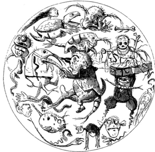
A drop of Thames water, as depicted by Punch in 1850

I have frequently had occasion to refer to the very injurious effects resulting from the use of impure water during the late epidemic. In nearly every city or town affected this element has been more or less prominent, and a number of most severe and fatal outbursts of cholera were referable to no other cause except the state of the water-supply. Such has especially been the case when the water was obtained from wells into which the contents of sewers or privies, or the drainage of graveyards, had escaped. The predisposition occasioned by the continued use of such water is perhaps the most fatal of all; and the proportion of deaths to attacks has generally been much greater in epidemic seizures resulting from it than from any other predisposing cause.