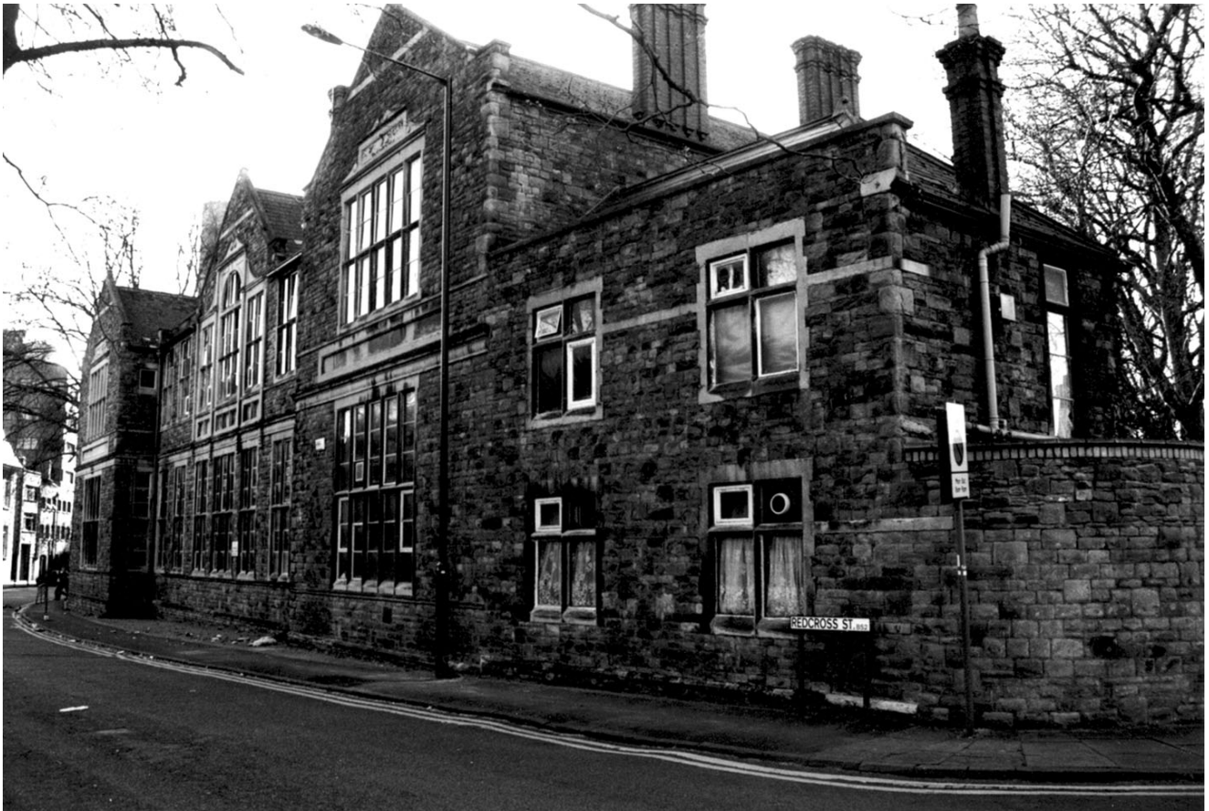
Figure 1 Redcross Street in 2002.